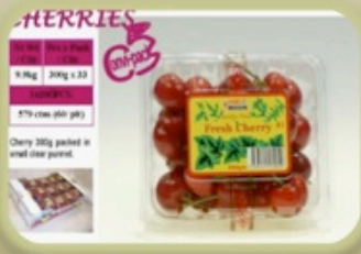
Cherries Harvested May – Jul Available May - Jul