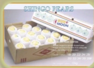
Shingo Pears Harvested Sep Available Jan – Apr & Sep - Dec