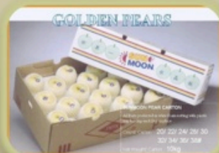
Golden Pears Harvested Sep Available Jan – Apr & Sep - Dec