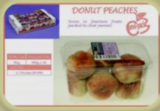
Donut Peaches Harvested Jun – Oct Available Jun - Nov