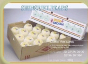
Shinseiki Pears Harvested Aug Available Aug - Dec