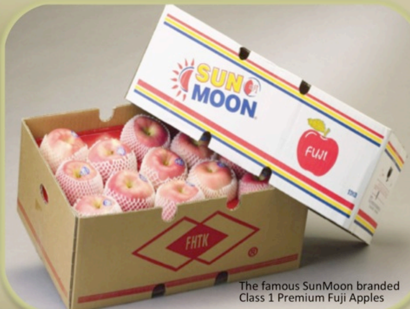
The famous SunMoon branded Class 1 Premium Fuji Apples