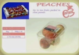
Peaches Harvested Jun – Oct Available Jun - Nov