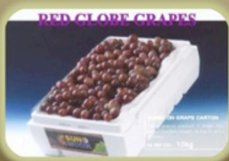
Red Globe Grapes Harvested Sep – Nov Available Jan – Feb & Sep - Dec