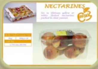
Nectarines Harvested Jun – Sep Available Jun - Sep