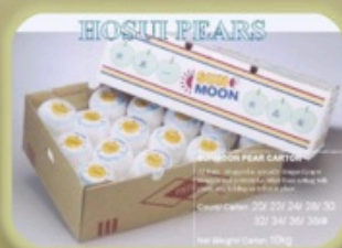
Hosui Pears Harvested Aug Available Aug - Dec