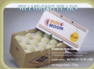
Shandong Pears Harvested Sep Available Jan – Jun & Sep - Dec